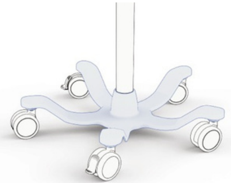
Low Centre of Gravity Base