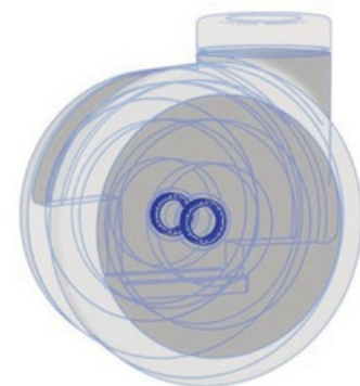
Sealed precision Ball Bearings

The selected 3" twin wheel, soft casters allow you to easily move this stand quietly and quickly. Two lockable casters secure the stand in place.